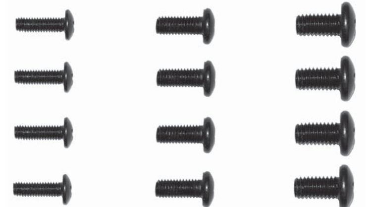
PM-04-B M4 x 16