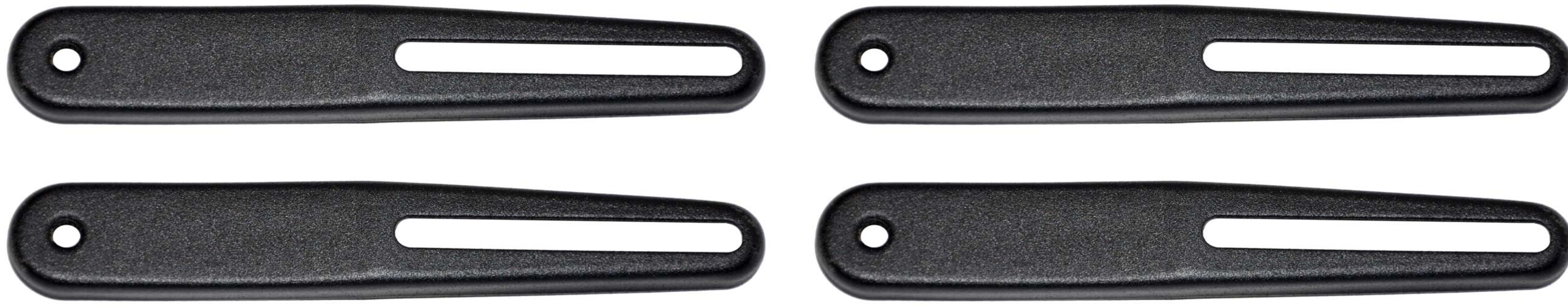
PM-12-B: Adjustment Arms